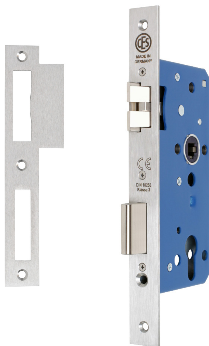
Article number 0522