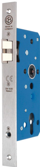
Article number 9100F